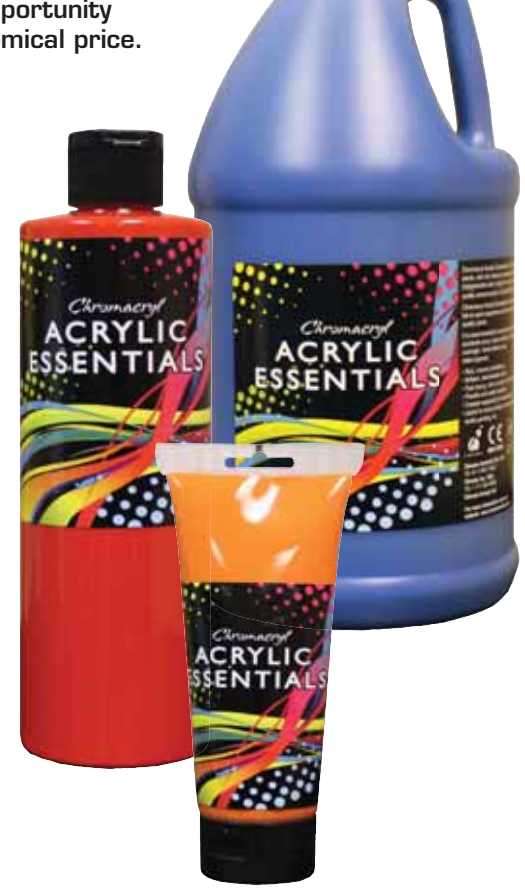
Available in 200ml tubes, pints & half gallons

The Chromacryl website, <u>www.chromaonline.com</u> is designed to help nurture creativity and provides product and color information.