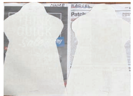
3. Calico puppet bodies pinned to newspaper — unpainted