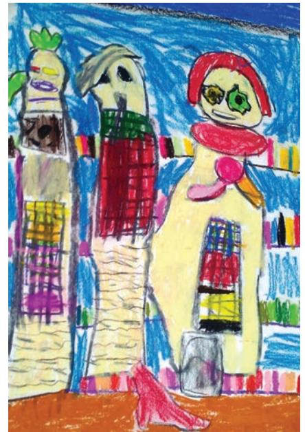
6. Drawing of a puppet group