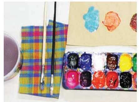
2. Art material set up