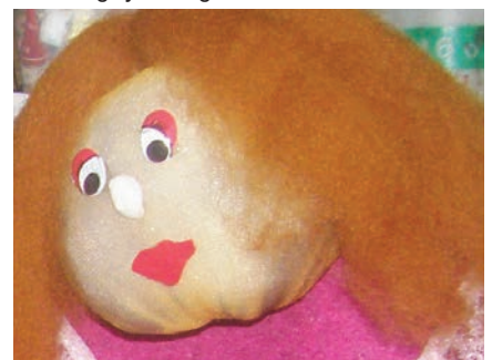
5. Puppet head