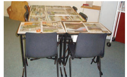
1. Room arrangement

Please note: If using charcoal, fix the charcoal drawing with Pastel Fixative before applying colour pastels, oil crayons or paint washes.