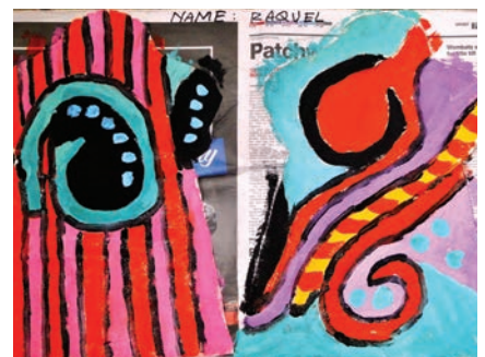
4. Painted calico puppet bodies left to dry thoroughly overnight