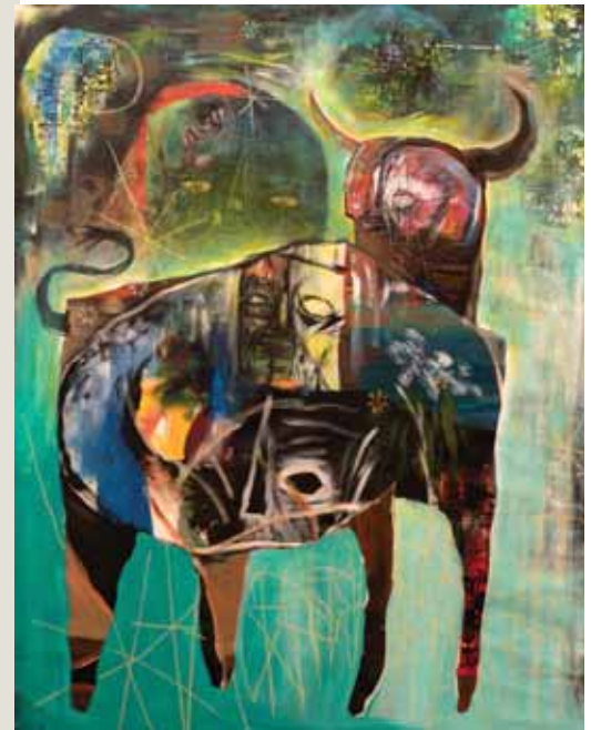
the-planets-all-watched-as-taurus-rose by Jesse Reno • www.jessereno.com