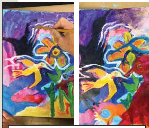
Follow ideas that come up while painting