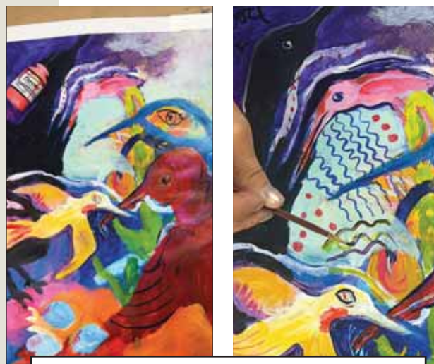
Add selective detail