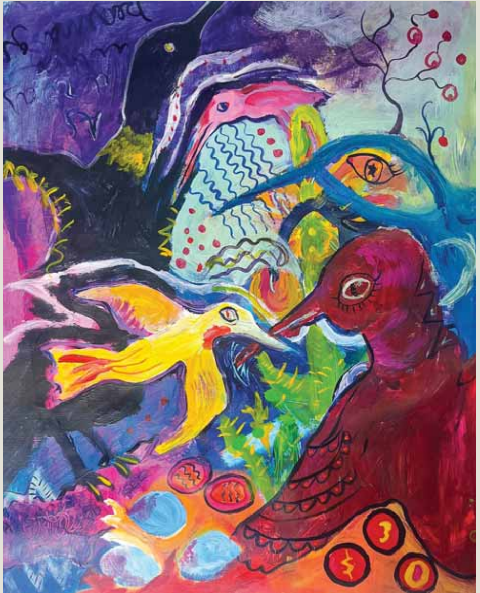
Birds of Paradise