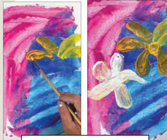
The development of a painting...